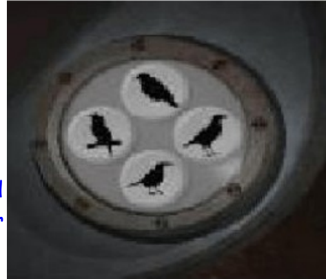
Bird T-Flyer Setting

Pass it into the next room. Another sphere-chair is found here. Sit in it. This one has a lever in the upper right corner, but it also has another circle in the upper left. Pull the lever and you get a short movie of the tower/cabin area. It will stop on a picture of some birds that we saw on that bird machine. Click on a bird. It changes. We need to put in the bird shapes that we recorded earlier around the Jacktower. Once you have them set correctly, turn the handle again. This T-runner is actually a T-flyer and you are in for a fun ride! Wheeeeeee!!!! You arrive in the Conservatory.